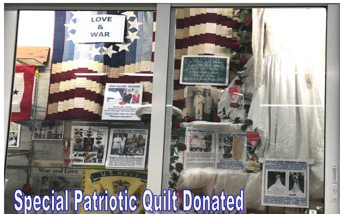
Special Patriotic Quilt Donated