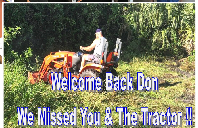
Welcome Back Don