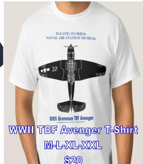
WWII TBF Avenger T-Shirt