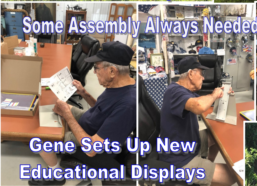
Some Assembly Always Needed