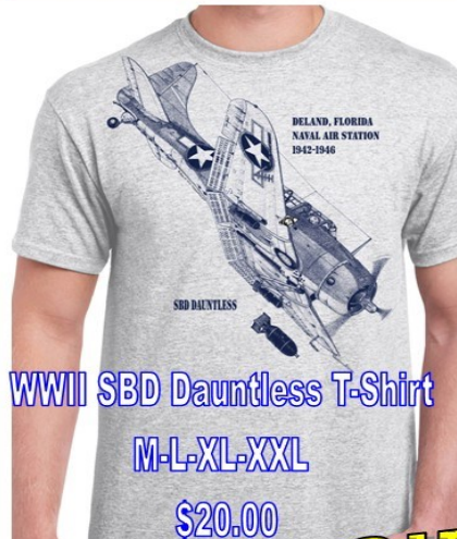
WWII SBD Dauntless T-Shirt