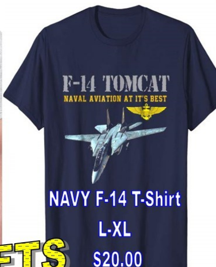
NAVY F-14 T-Shirt